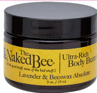
8100 LAVENDER & BEESWAX BODY BUTTER 3 oz.