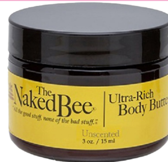
8102 UNSCENTED BODY BUTTER 3 oz.