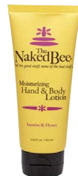
8111 JASMINE & HONEY HAND & BODY LOTION Certified organic aloe vera and sunflower seed oil. Rich in anti-oxidants. 2.25 oz.