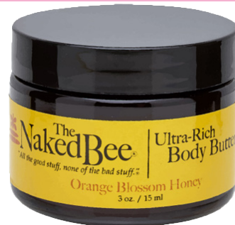
8101 ORANGE BLOSSOM BODY BUTTER 3 oz.