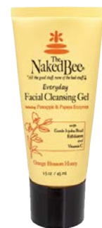
8120 EVERYDAY FACIAL CLEANSING GEL Wash away dirt and grime with gentle jojoba bead exfoliators and enrich your skin with Vitamin C. 1.5 oz.