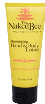
8110 GRAPFRUIT BLOSSOM HONEY HAND & BODY LOTION Certified organic aloe vera and sunflower seed oil. Rich in anti-oxidants. 2.25 oz.