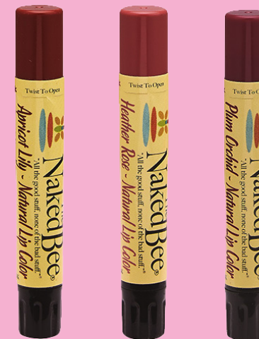
8088 APRICOT LILY LIP COLOR .15 oz. 8089 HEATHER ROSE LIP COLOR .15 oz. 8090 PLUM ORCHID LIP COLOR .15 oz.