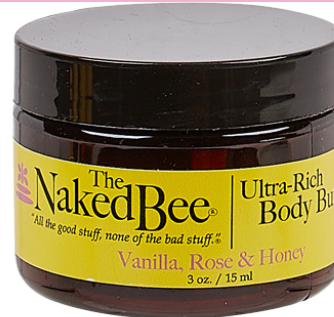
8103 VANILLA, ROSE & HONEY BODY BUTTER 3 oz.